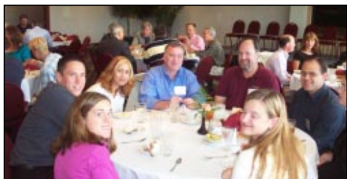
The food and friends were great at lunch.