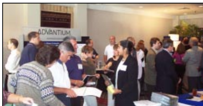
The vendor show was a busy place.