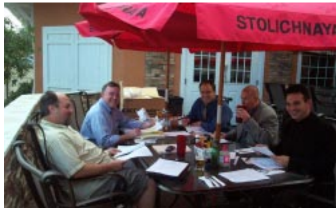
GHALI committee men hard at work.