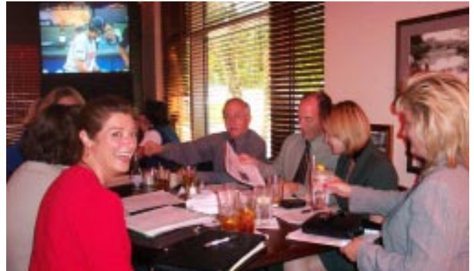
Newsletter committee shares a laugh.