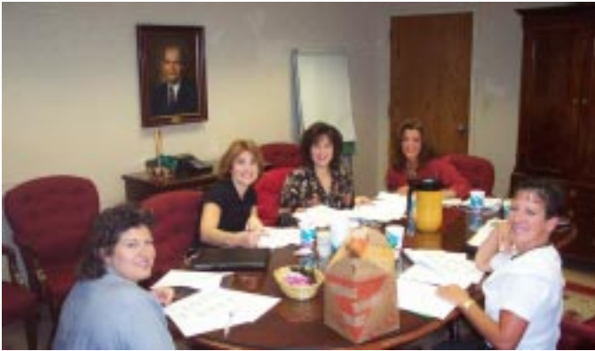
The network committee plans an event.

committees have been organizing, recruiting and working on our seminars for the year. Various other committees have been meeting for breakfast or dinner to get their work done. As you can see by the pictures below, it hasn't been all hard work!